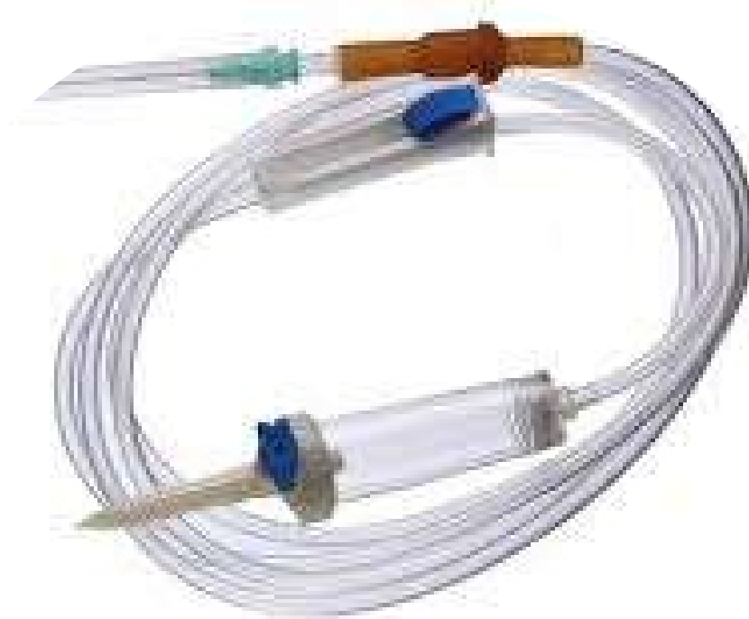
VENTED INFUSION SET CODE :- PMPL/IVV/002